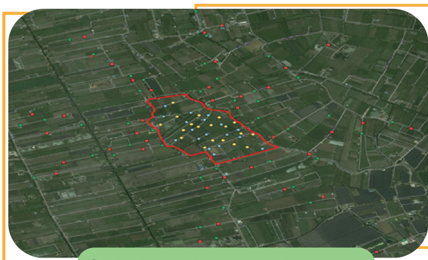
● Thailand Trial Area -136 Acres ●